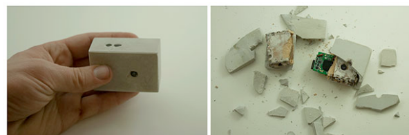
Figure 1. The Inaccessible Digital Camera [40].

The inaccessible camera can be seen as counterfactual in that it draws its owner into a familiar device and interaction—taking a photo with a camera. However, its form and composition depart into an alternative situation in which one must destroy the digital device recording one’s life experiences in order to access these digital records. In our contemporary world of constant availability and connectedness, these counterfunctional cameras project a critical stance on ‘functionality’—one based on inhibiting, restricting or removing common or expected features of a technology. To initiate consumption of one’s digital photographs, one must first encounter the discomfort of destruction. On a broader level, encounters with the inaccessible camera invite critical reflection on one’s own practices contributing to unchecked digital content production and the almost unnoticed or assumed eventual obsolescence and disposal of everyday digital devices.