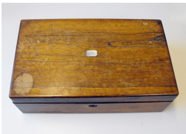
Figure 4. The photobox largely took the form of a European oak chest. [36]

Photobox [36]—The Photobox is a domestic technology embodied in the form of a well-worn antique chest that prints four or five randomly selected photos from the owner’s Flickr collection at random intervals each month (see figure 4). The two main components of Photobox are an oak chest and a Bluetooth-enabled Polaroid Pogo printer (which makes 2x3 inch photos). All technological components are embedded in an upper panel in the chest in an effort to hide of ‘technological’ components from view. The printer is installed in an acrylic case that secured it to a