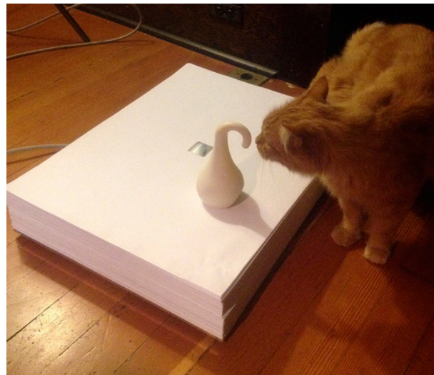
Figure 3. The table-non-table [54].

participants to more broadly consider their relationships to other machines and objects in the home. The Rudiments effectively struck the balance between offering relatively familiar materials and formal aesthetics, while operating in unfamiliar ways that opened up new possibilities for thinking about human relations to everyday computational things. Rudiment #1 itself, along with the speculations triggered by household members’ lived-with encounters, helped develop and advance a speculative space for moving beyond the design of “machines for our own good, to a possibility of interactive machines that might exhibit autonomy, but not as we know it” [26, p. 152].